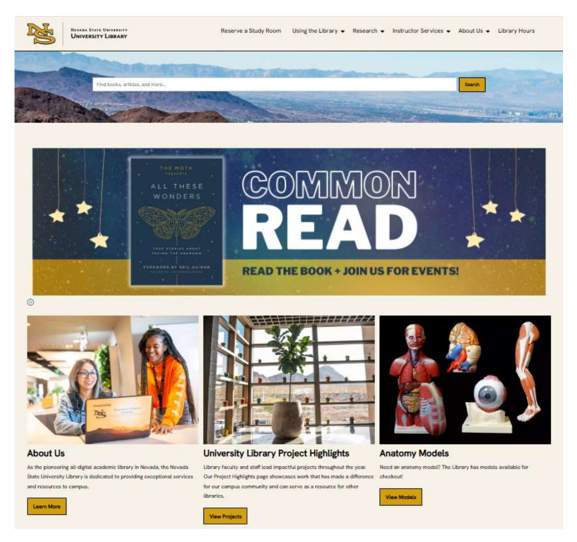
Image: Improvements to the library's home page included a new banner image and callouts.