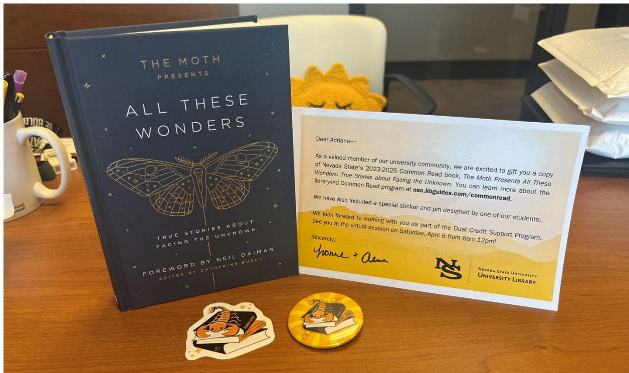
Image: To generate excitement about the program, participants received a surprise package in the mail with a brief note, Common Read book, and library branded items.

Library faculty created program outcomes and designed a workshop to assist dual credit instructors with assignment creation. The program outline included: